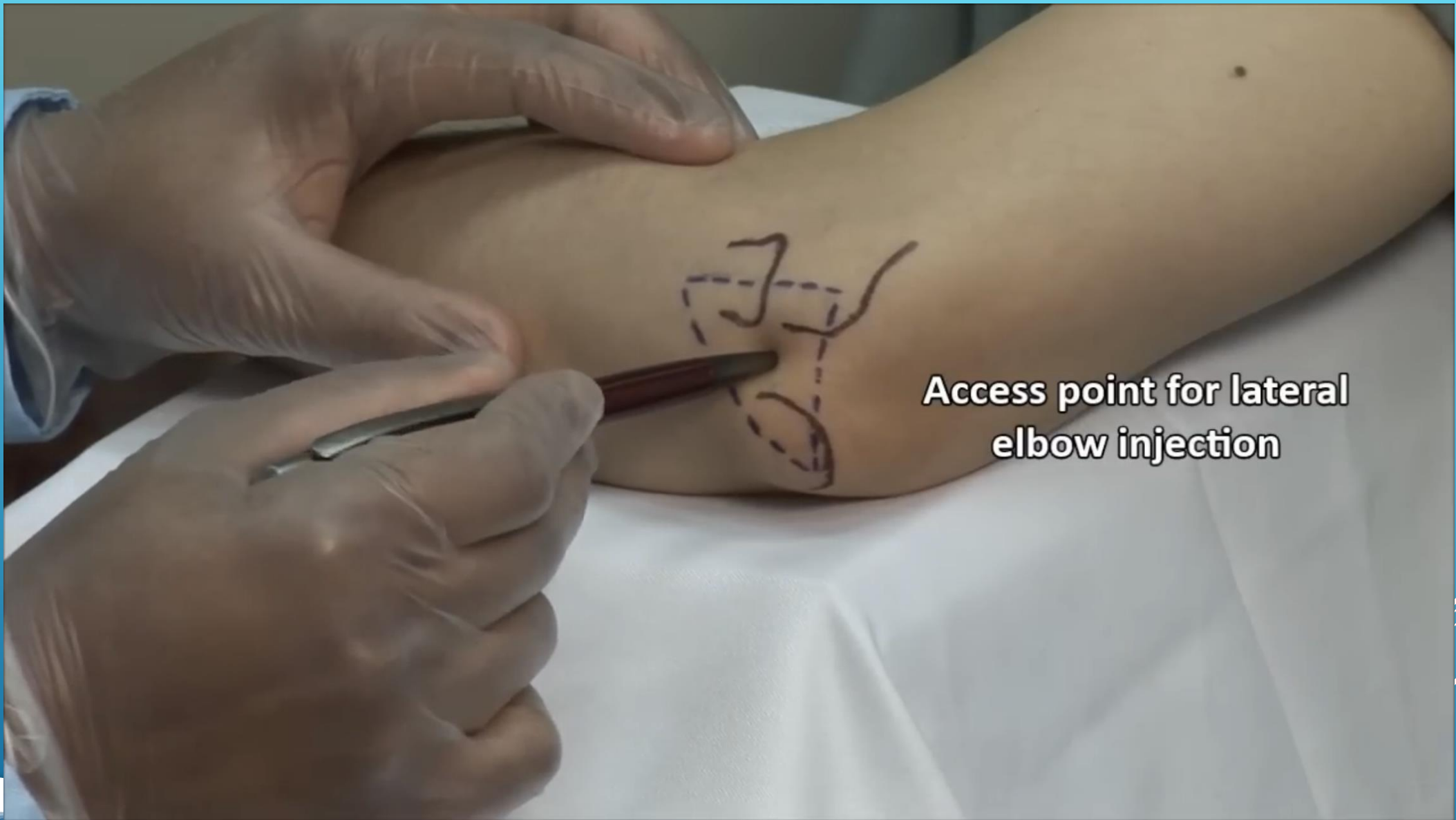
Access point for lateral elbow injection